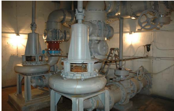
HLSA Main Pump Station

The pump station has two 150 hp. pumps that deliver 4,200 gpm into a 24 inch forcemain. The station was designed with pneumatically actuated pump control valves. The valves were intended to slowly open and close during each pump cycle thereby reducing water hammer. However, the valves often failed to fully close, resulting in backflow and shorter pump cycle times. The valves were also prone to mechanical failures causing water hammer forces in the pump station.