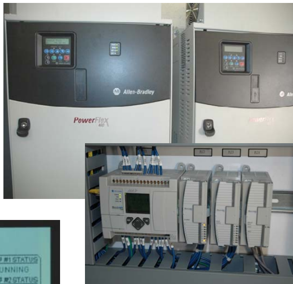
New 150 hp. motor variable frequency drives and programmable logic controller

HLSA staff report that the power cost savings have been significant. Additionally, the maintenance needed at the pump station was reduced substantially. Brett Yardley, the HLSA Superintendent, said that "The station is very reliable – we don't worry about it anymore. Now only need to make routine visits to the station. The emergency repairs and station checks that used to be required due to motor tripping or other malfunctions have been virtually eliminated."