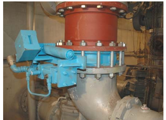
New pump control valve

The solution involved three key components. First, the pneumatic pump control valves were replaced with a hydraulically modulated surge control check valve. Second, each pump motor was fitted with a new Variable Frequency Drive (VFD) to allow variable speed start up and shut down modes. Third, a new programmable controller was installed with a custom program that could operate the station in either an "on/off" mode, or a continuous-variable speed mode to match incoming flows.