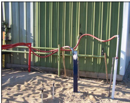
Photograph of monitor wells, biovent wells and monitor points.

Bioventing is a hybrid of technology and Mother Nature. The natural degradation of some types of contaminants by bacteria has been recognized for many years. However, remediation experts discovered they could assist and enhance this process by simply adding air to the equation.