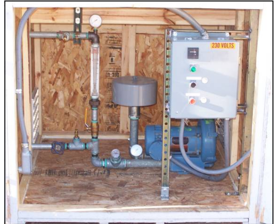
Photograph of a typical biovent blower and enclosure.

The aerobic bacteria that live in soil will consume hydrocarbons when conditions like moisture, pH, and temperature are right. However, when available oxygen is depleted by the bacteria feeding on the hydrocarbons, the process slows and eventually halts as the bacteria die of asphyxiation. They essentially eat and breathe themselves to death.