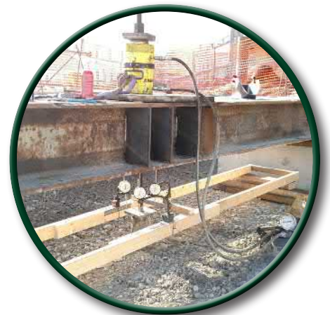
Pile load testing

Our in-house drilling capability provides prompt and thorough investigations of the on-site soil and groundwater conditions. Drilling crews have worked on thousands of projects throughout Michigan. Our drillers have a wealth of experience on jobs where the accurate and careful determination of geologic conditions is critical to a project's success.