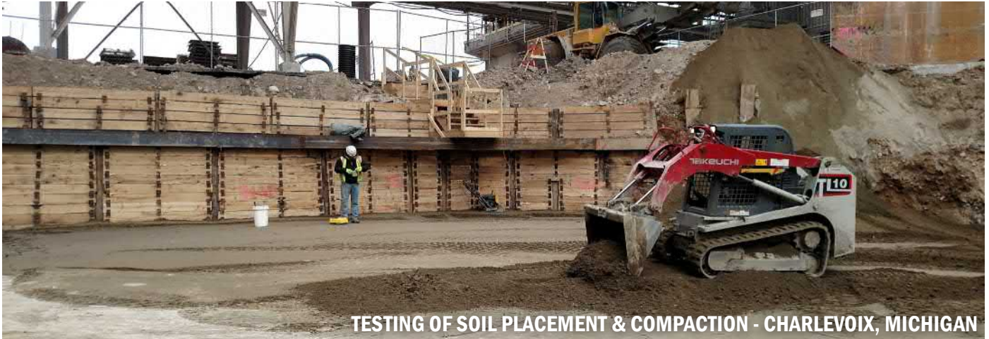
TESTING OF SOIL PLACEMENT & COMPACTION - CHARLEVOIX, MICHIGAN