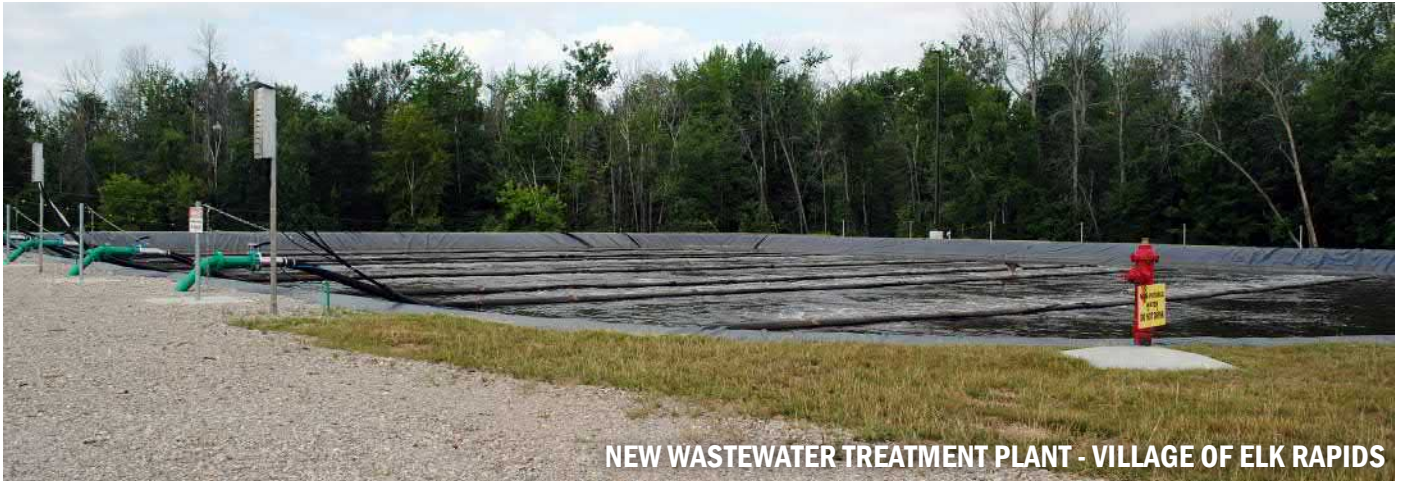
NEW WASTEWATER TREATMENT PLANT - VILLAGE OF ELK RAPIDS