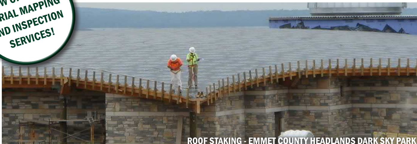
ROOF STAKING - EMMET COUNTY HEADLANDS DARK SKY PARK

NOW OFFERING AERIAL MAPPING AND INSPECTION SERVICES!