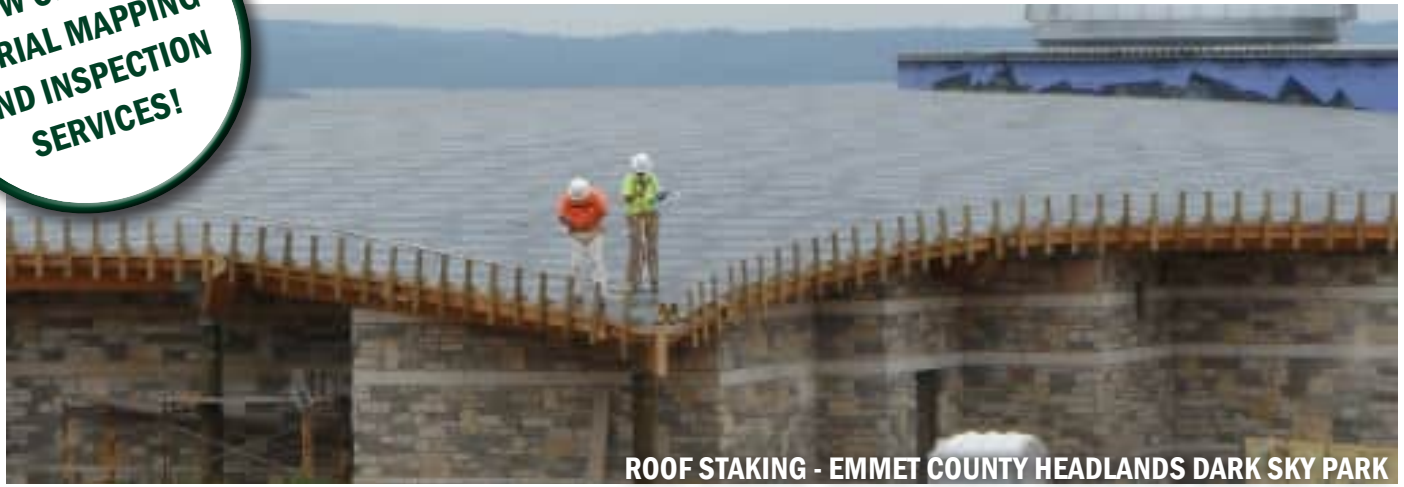
ROOF STAKING - EMMET COUNTY HEADLANDS DARK SKY PARK

NOW OFFERING AERIAL MAPPING AND INSPECTION SERVICES!