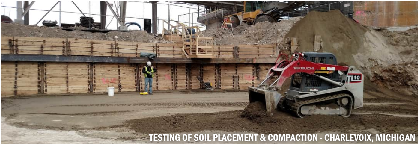
TESTING OF SOIL PLACEMENT & COMPACTION - CHARLEVOIX, MICHIGAN