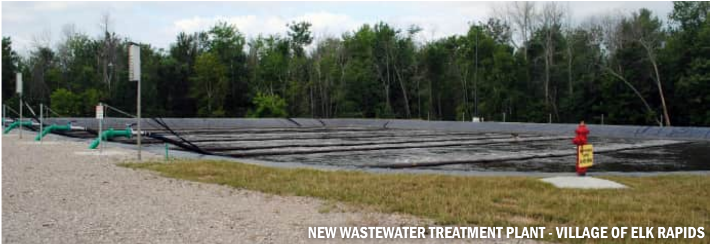
NEW WASTEWATER TREATMENT PLANT - VILLAGE OF ELK RAPIDS