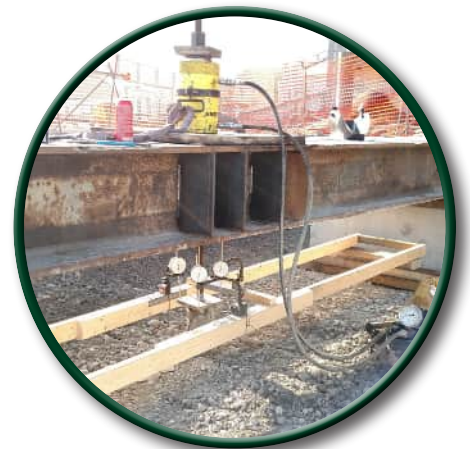
Pile load testing

Our in-house drilling capability provides prompt and thorough investigations of the on-site soil and groundwater conditions. Drilling crews have worked on thousands of projects throughout Michigan. Our drillers have a wealth of experience on jobs where the accurate and careful determination of geologic conditions is critical to a project’s success.