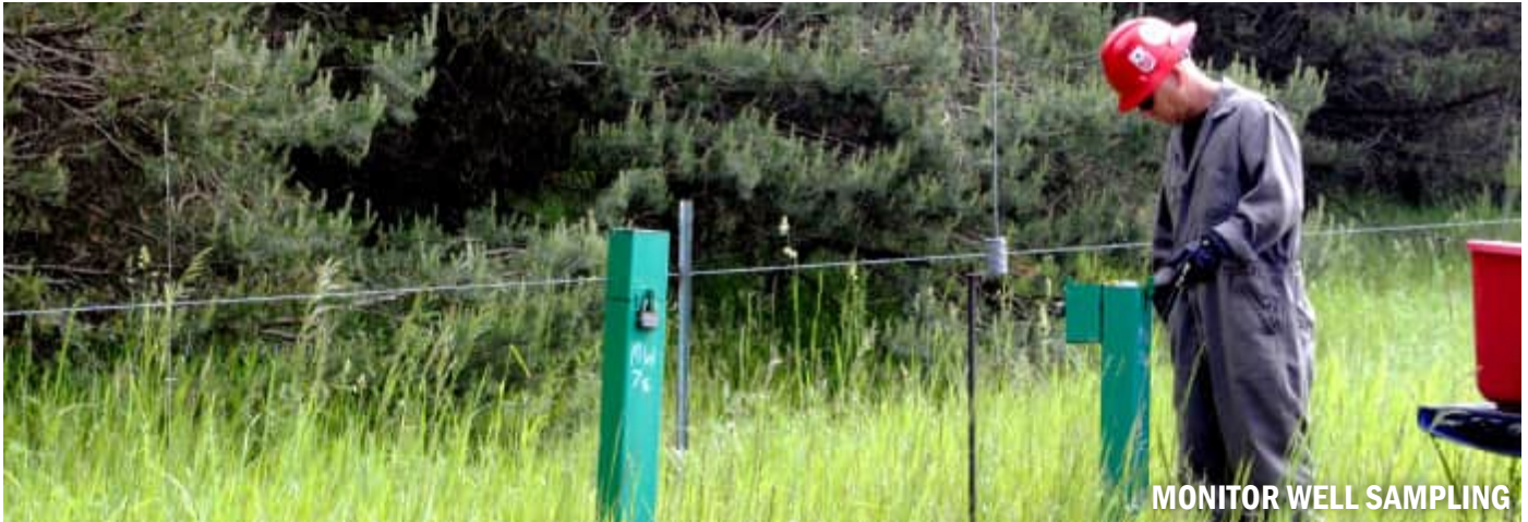
MONITOR WELL SAMPLING